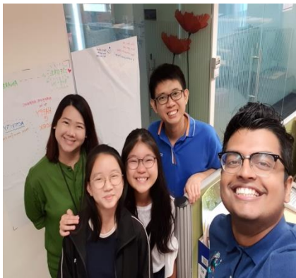
Food Drinks & Allied Workers Union