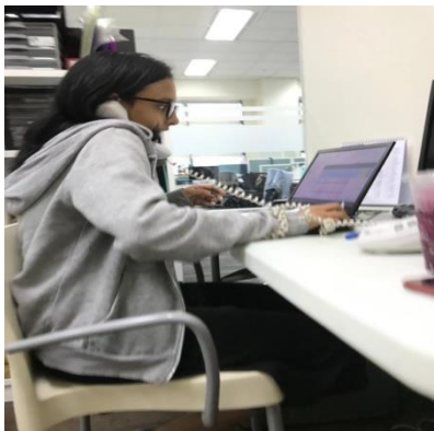
Focus on the Family