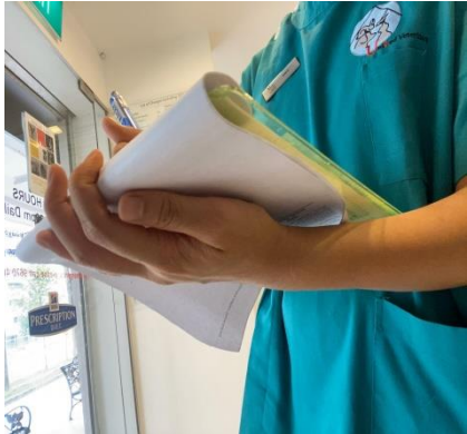
United Veterinary Clinic