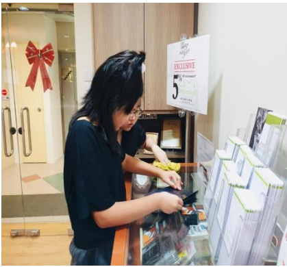
Tanglewood Music School