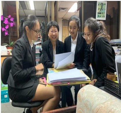
Ho & Associates